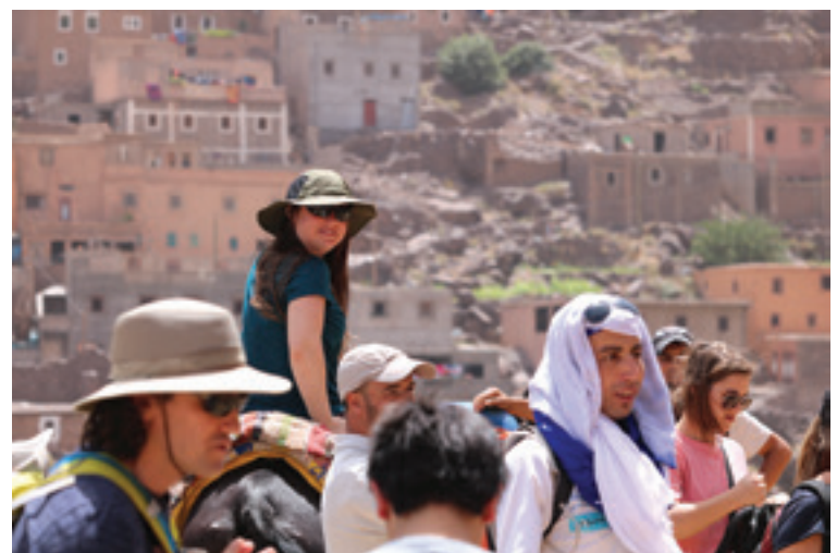
Hiking trail from Imlil village in the Atlas mountains to Toubkal, the highest peak in North Africa at 13,671 feet.