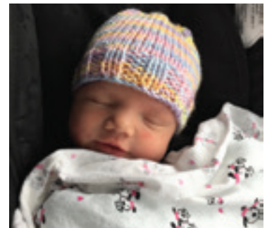
Child of Obold ('12) and Stafford ('15)