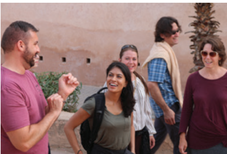
Walking around the Kasbah in Rabat.