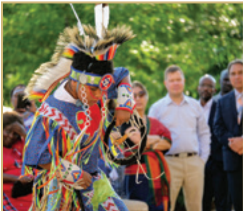
A Denver area Native American youth performing a traditional dance for participants.