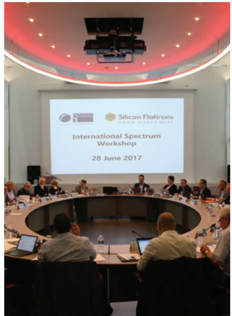
A presentation in the Raymond Aron conference room.

The spectrum workshop was organized with support from the multinational law firm Hogan Lovells, the GSM Association, and the Center for Technology, Innovation and Competition at the University of Pennsylvania Law School. Recognizing the power of the global perspective in law, technology, and entrepreneurship, Silicon Flatirons is executing its strategic plan for broader international outreach, working with interested parties to connect Colorado Law with other continents.