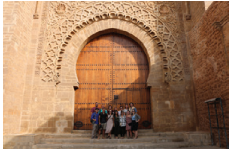
Kasbah main gate, Rabat