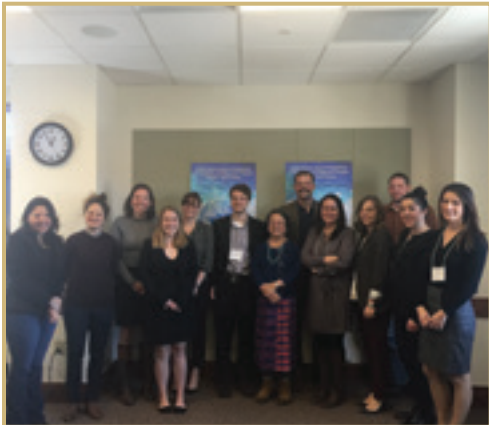
Law students, faculty, and staff with U.N. Special Rapporteur on the Rights of Indigenous Peoples Victoria Tauli-Corpuz (center).