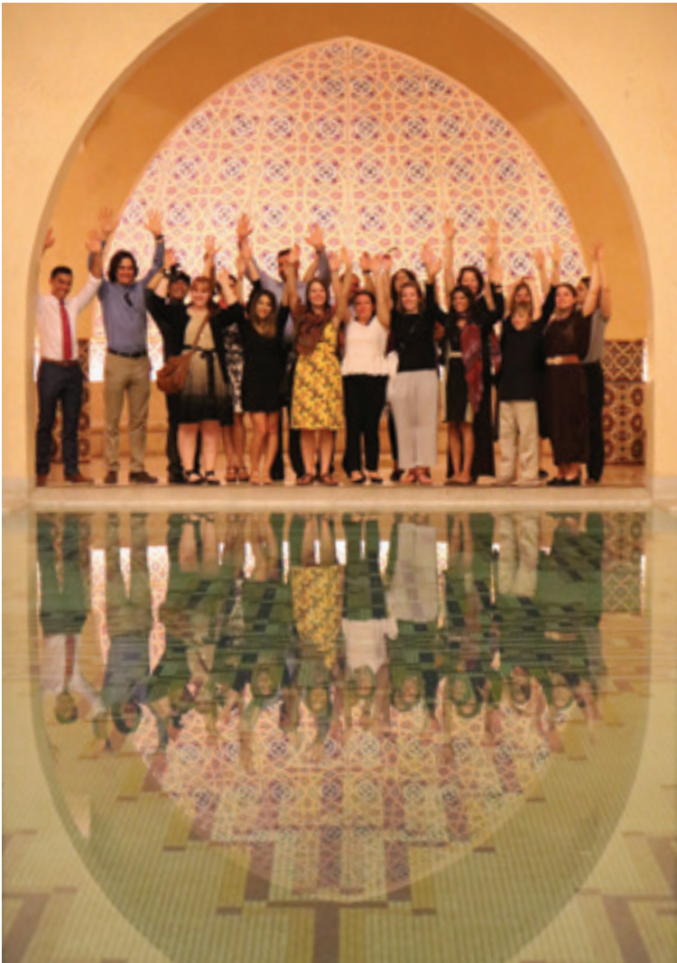
The group inside Hassan II Mosque in Casablanca