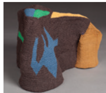
Fiber art of Canner ('87)