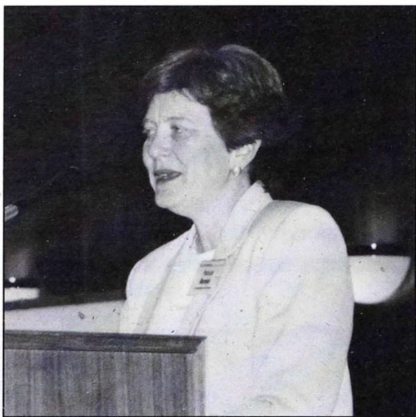
Beneke highlights DOI water policy

and plausible alternatives to this expensive, time-consuming process.