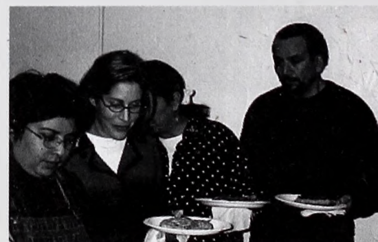
Taco dinner at NARF.