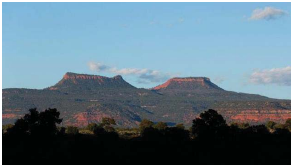
The Bears Ears Buttes as seen from Natural Bridges National Monument

Indian people have lived in the Bears Ears region since time immemorial. 10 As many as thirty tribes have called the land their home at some point. Some came through, some came and left, many stayed. 11 Beginning in the 1860s, tribal people were forced out of Bears Ears. Military efforts included federal troops marching Navajo people out of the region as part of the Long Walk that began in 1864. 12 Non-Indian settlers, who began to arrive in 1880, co-existed well with tribal people at first but, in time, began aggressively driving Natives off the land. Government policy required tribal members to remain on their reservations. 13 Tribes that had freely traveled across the Southwest—following sources of food to hunt, gathering medicinal herbs, and visiting sacred sites legendary to their world views—were now confined to reservations. But these arbitrary borders drawn could not stop Indian people from returning to the Bears Ears region. Those who had called this land home