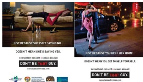
Figure 1. “Just Because” Ad Campaign. 20

Today, dominance, cultural, and sex-positive positions are not neatly siloed. The feminist pro-sex and anti-sex lines have become so very blurred that there is a conflicted quality to the “feminist” view on sex. Young feminists celebrate norm-defying and exciting sex on the margins. At the same time, they proclaim that sex is traumatic assault without an affirmative and unambiguous expression of agreement. 17 Activists claim the “slut” label, proudly marching nearly naked or in scanty S/M garb. At the same time, they condemn actual commercial sex as modern-day slavery. 18 Feminist students at Stanford attend a Black Lives Matter rally on Monday and on Tuesday support higher sentences in sexual offenses because Brock Turner got off too lightly. 19 College sexual misconduct offices produce messages and images dictating that boys protect girls from their, other men’s, or the girl’s own sexual inclinations. The posters are head-scratchers. How could any program that stems from feminist antirape sensibilities produce a pictorial of a stumbling drunk girl in a short red dress and ankle-breaking heels, hair spilling to conceal her face, leaning helplessly on a well-groomed, in-control boy, with the caption, “Just Because You Help Her Home Doesn’t Mean You Get To Help Yourself”?